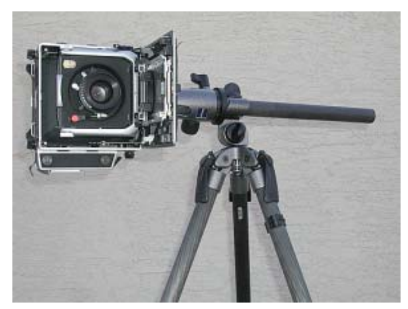
Linhof 4x5 mounted sideways and Vertically on the tripod. This setup is not necessary to take a vertical photograph thanks to the rotating back. However, it can be useful in certain occasions, such as with wide angle lenses when using the drop bed feature (needed to avoid having the bed in the photograph) is not practical.