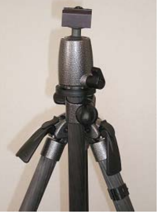
Two wiews of the 2227 with the Gitzo 1277M ballhead and quick release adapter