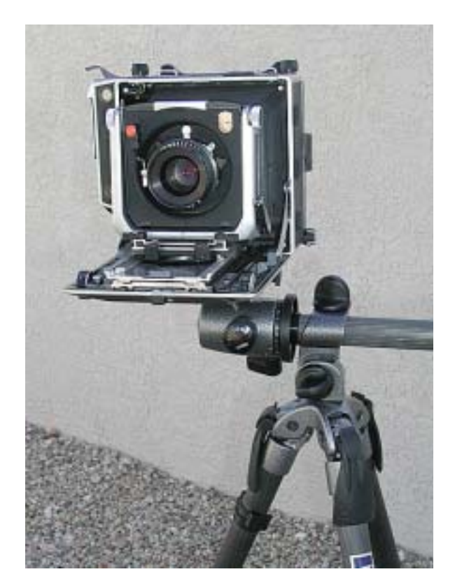
Linhof 4x5 mounted sideways and vertically on the tripod. Since the Linhof has a rotating back it is possible to take both vertical and horizontal view with this setup.