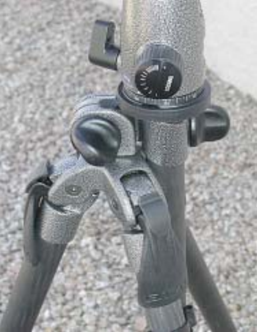
Close up view of the tripod and the 1277M magnesium ballhead. Note that the ballhead has only 2 adjustment knobs, one for the panoramic rotation and the other for the ballhead movements. The 2377M ballhead has 3 adjustments, the third one being a ballhead tightness control.