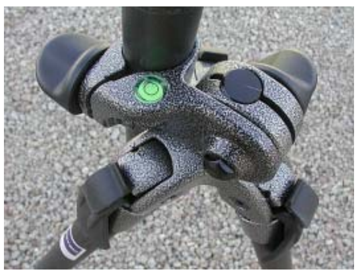
Top view of the beautiful cast magnesium piece which holds the tripod legs and the center column plus all the knobs needed to secure them. Note the built-in bubble level.