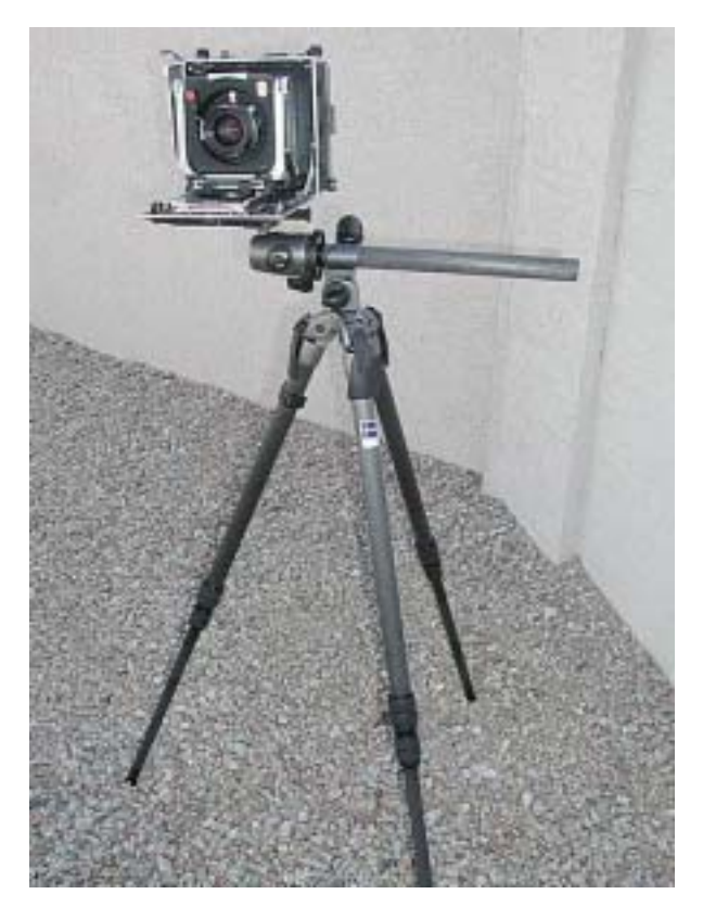
Linhof Master Teknica on sideways center column. Since the center of gravity is only off a couple inches from the actual center of the tripod this configuration is actually quite rigid and vibration free.

The Gitzo 2227, and its 4 leg-sections counterpart the 2228, is a wonderful tripod with capabilities which extend what most tripods can do. Is it for you? Why not? Even if you do not need these unique capabilities now, knowing they are available will expand your photographic options and perhaps lead you to create images you wouldn't have created otherwise. Since the weight and price of the 2227 are similar to Gitzo tripods of comparable size you may want to give it a try?