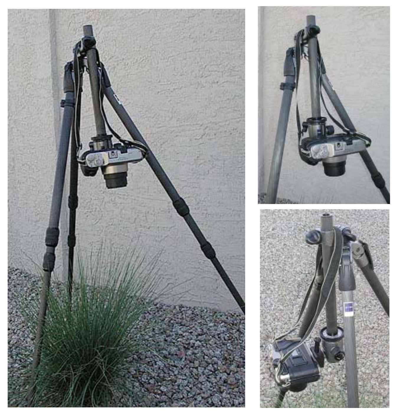
The Fuji 645 zi mounted sideways and downward. The ideal setup to photograph close ups of elements on the ground. Note that the tripod can be positioned closer to the ground simply by not extending the legs as much as I did. Make sure the camera shoulder strap is not in the frame!

For the grand finale here is the 2227 in an acrobatic position with the center column and the camera pointed downwards. This is certainly a great capability for close ups of objects on the ground. Stability is excellent with the Fuji 645 and I believe I could use the 4x5 in this position, although I have not tried. It is certainly fully usable with 35mm.